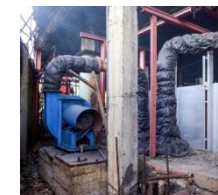
Recovering waste heat